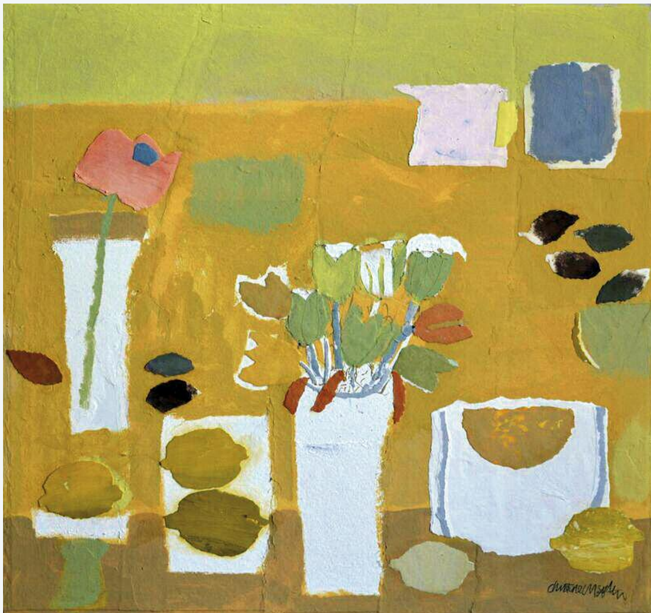
TOP Christine McArthur Yellow Table , oil and collage on board, 76 x 76 cm