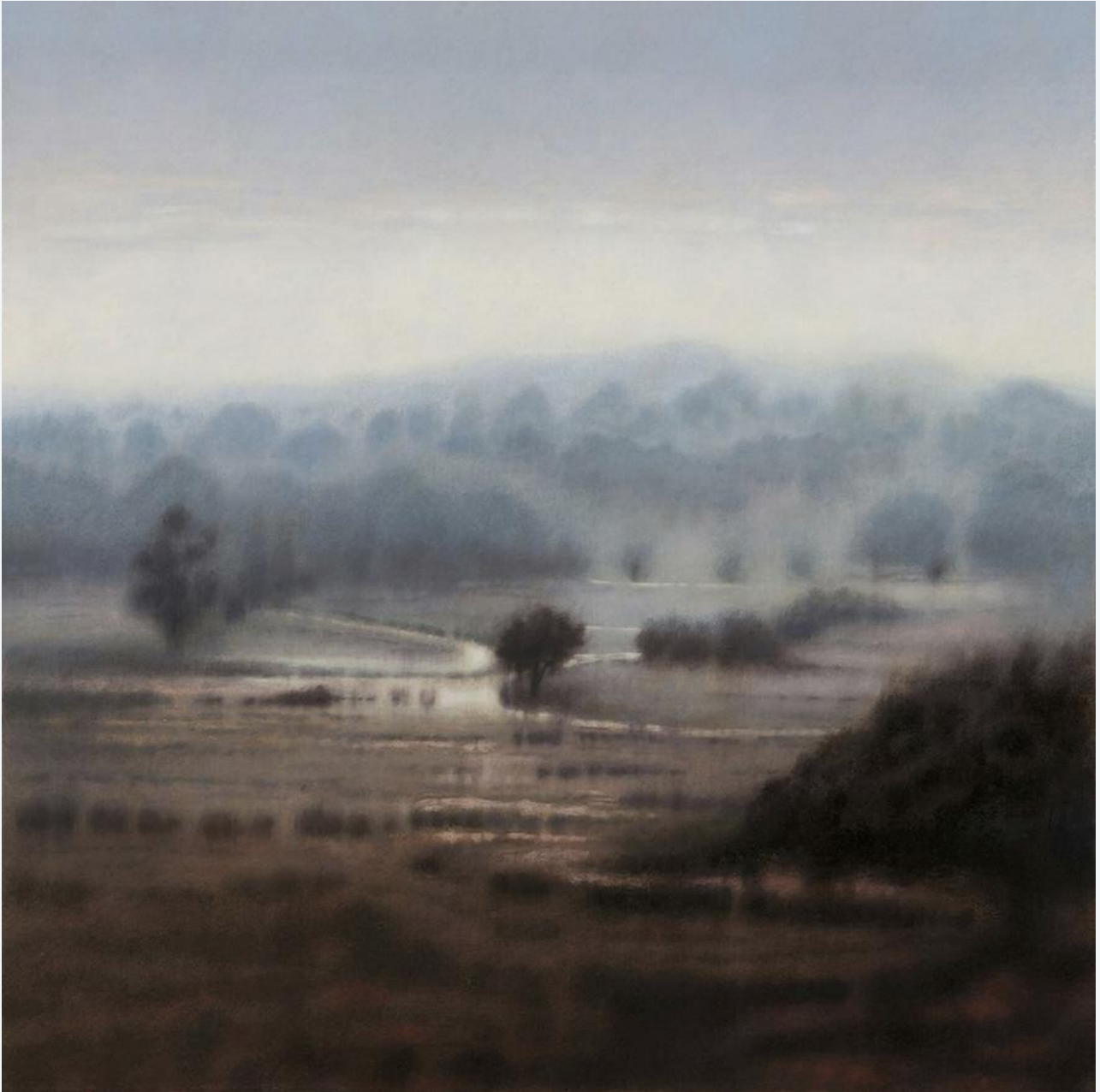
Tania Rutland, Floodplain , oil on canvas, 100 × 100 cm